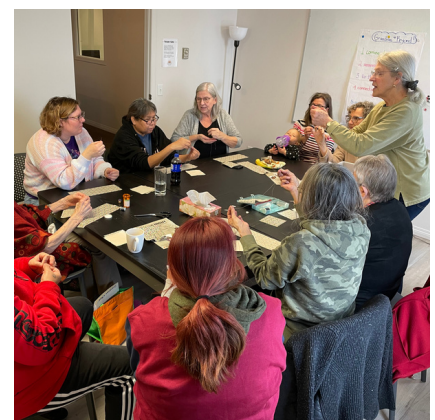
QUILT MAKING WITH GRANDMA'S GROUP