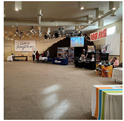
REGIONAL CONNECTIONS JOB FAIR HELD AT TCE