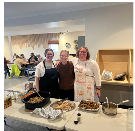
THANKSGIVING MEAL AT DROP-IN