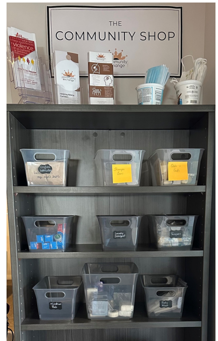
COMMUNITY SHOP SHELVES