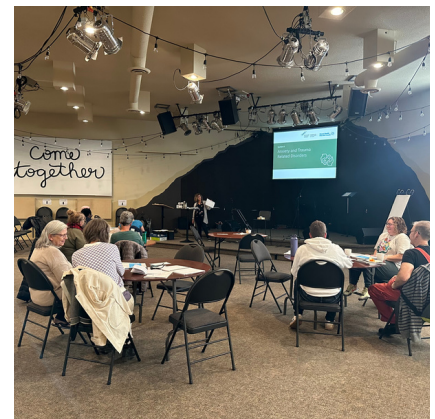
MENTAL HEALTH FIRST AID COURSE