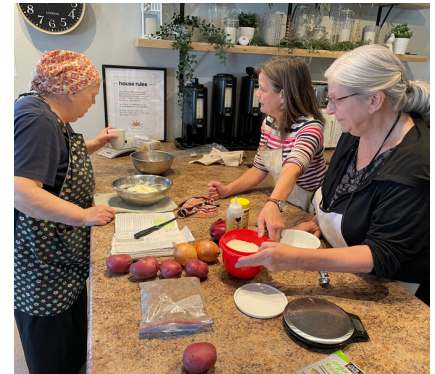
MAKING FOOD TOGETHER