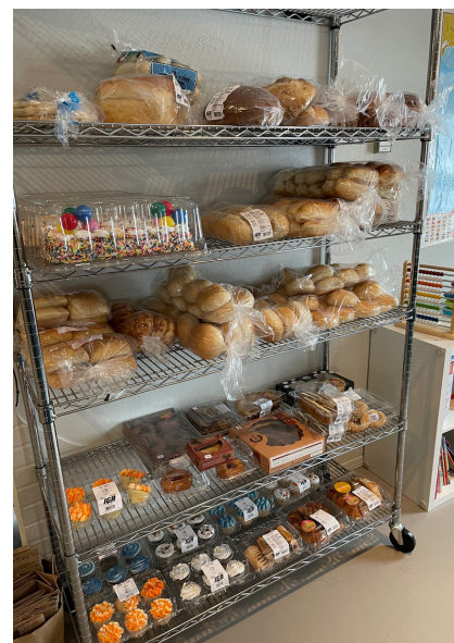
TCE FOOD RESCUE SHELF

WE ARE SO GRATEFUL FOR THE DONATIONS WE HAVE RECEIVED TO DATE, BOTH MONETARY AND TIME. VOLUNTEERS AND FINANCIAL RESOURCES ARE ESSENTIAL TO HELP ALL OF OUR PROGRAMS RUN.