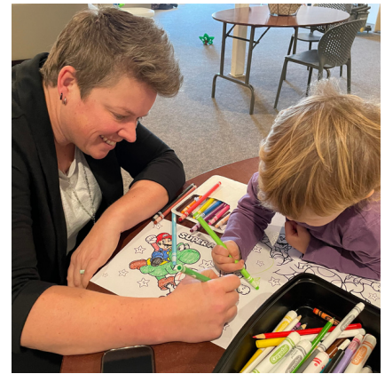
COLOURING TOGETHER DURING DROP-IN